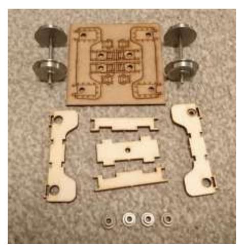
Fox Patent Style Bogie Kit

It is suggested that you read these instructions through before commencing construction.