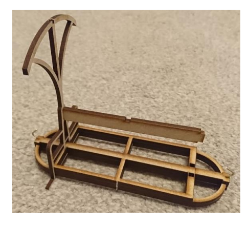
Top Tip - It is suggested that the next 7 steps are carried out in quick succession to allow full alignment before the glue dries

Glue the backrest into one of the end frames. Make sure that the centre notch in the backrest is placed to the top