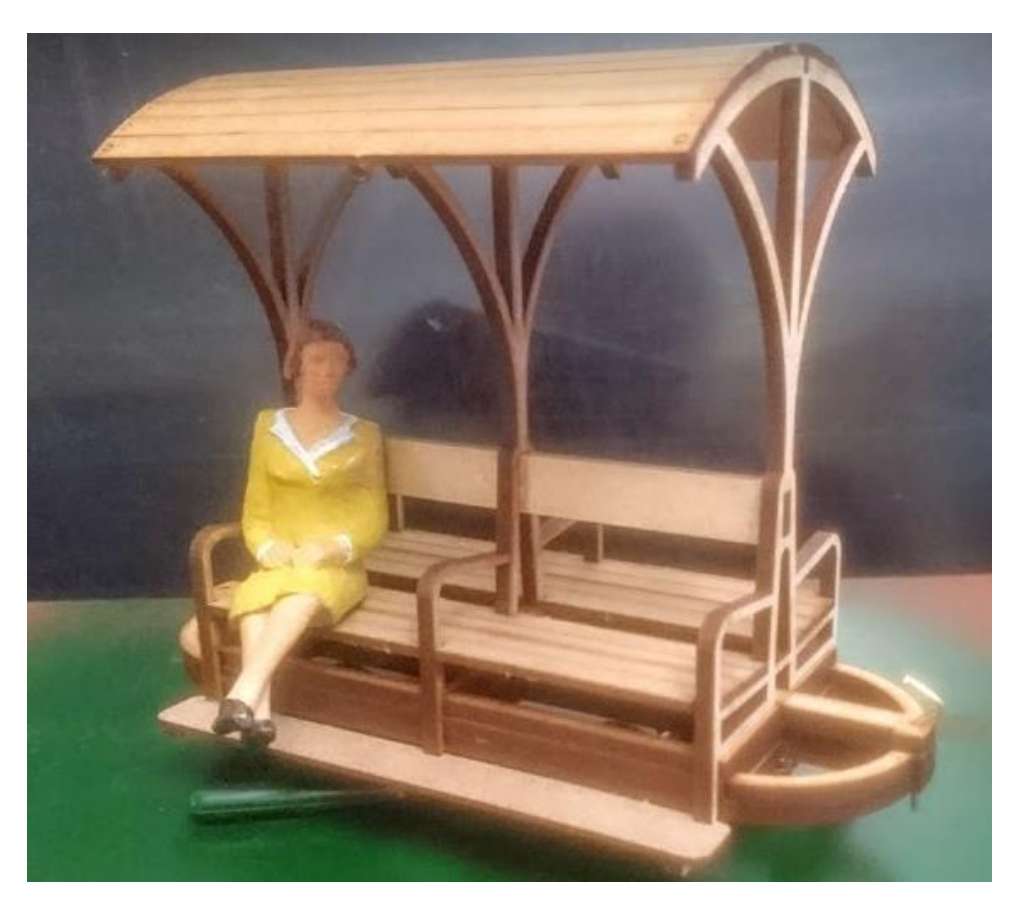
Well done - Your Sitzwagen is now complete!

We hope you enjoy your kit, but if you have any problem with construction email our technical help line at techhelp@hglw.co.uk